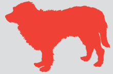
GIANT DOG (over 40 kg)

PLEASE NOTE: The discount is available to clients for the stated procedures undertaken at our practice, and at no other external clinics, private cremations, out-of-hours consultations or referrals.