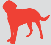
LARGE DOG (over 20 kg up to 40 kg)